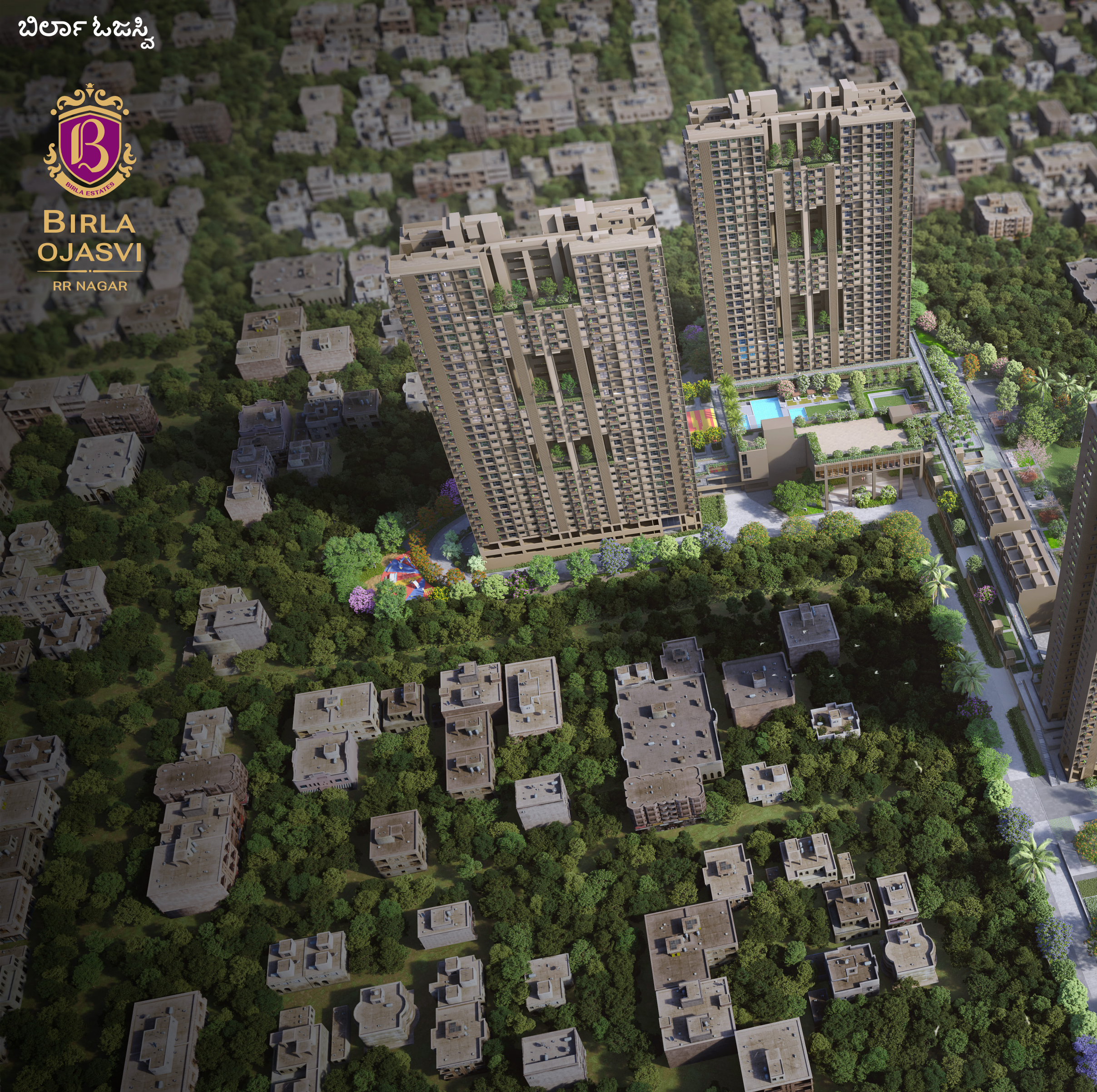
The Project "Birla Ojasvi" is registered with Karnataka RERA under the Registration No. PRM/KA/RERA/1251/310/PR/040924/006989 and can be viewed at https://rera.karnataka.gov.in. consisting of 3 Highrise Towers - 1, 2 & 3, Row Houses and a Clubhouse.